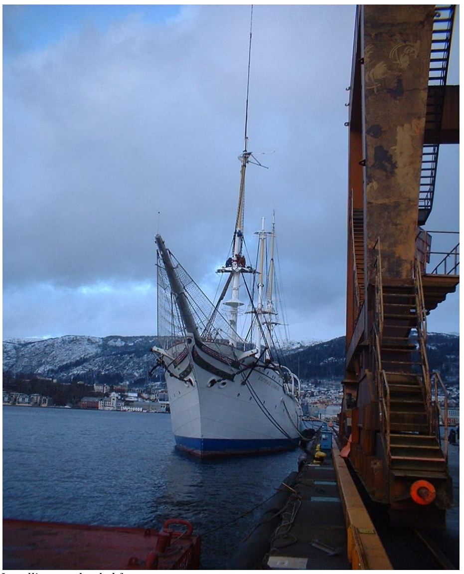
Installing overhauled fore topmast