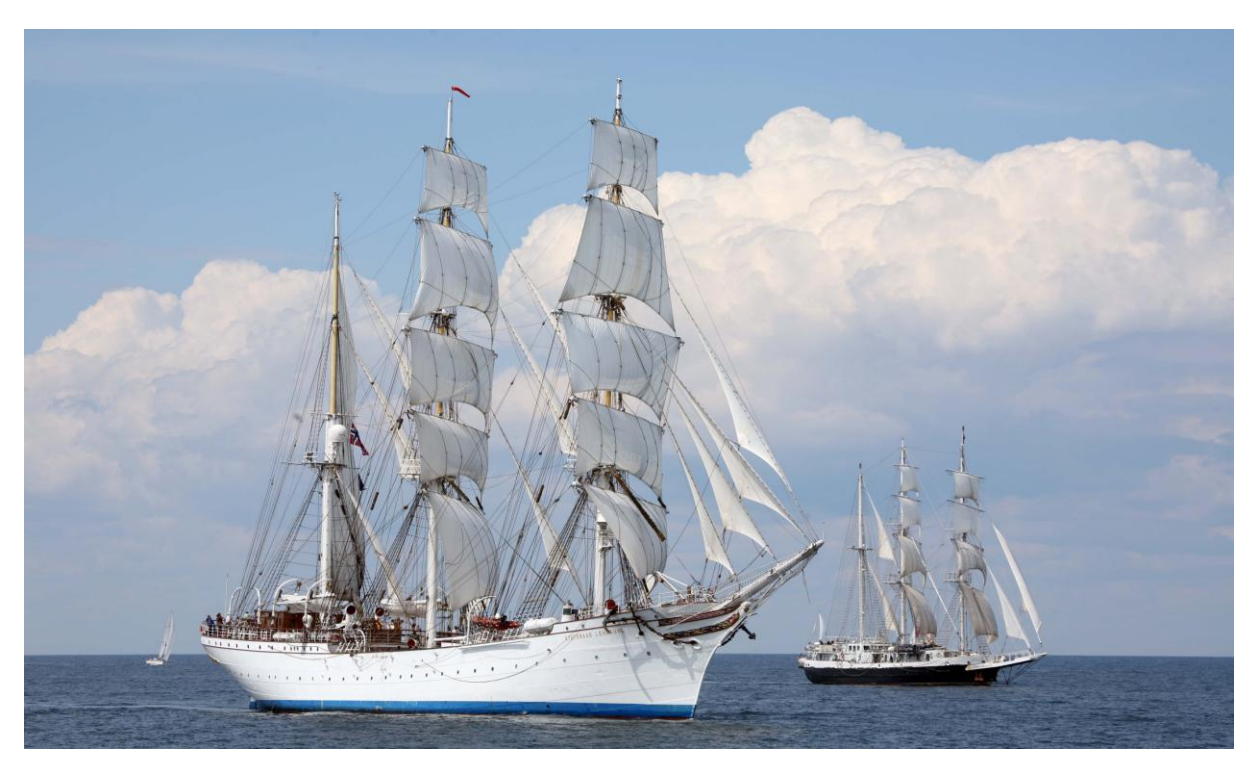
From Wikipedia, the free encyclopedia

MMSI: 258113000 IMO: 5339248 CALLSIGN: LDRG FLAG: NORWAY